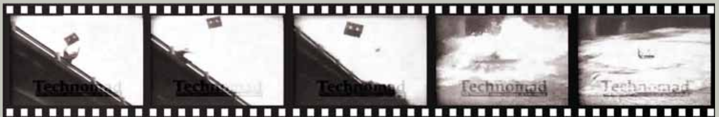
Technomad Loudspeaker Surviving 15 Meter Water-Drop

Record custom announcements, music, warning tones, and sound effects and play them back