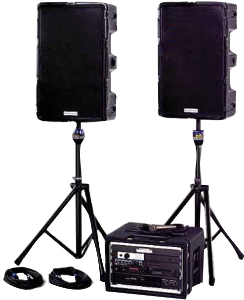
Directional PA Systems (Long Range)