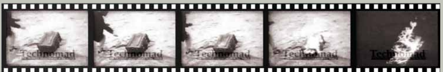
Technomad Loudspeaker Surviving 5 minute Petrol Burn