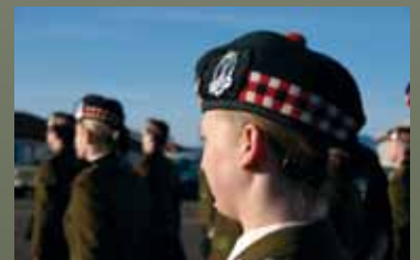
Canadian Armed Forces