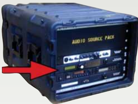
Installed in an Audio Source Pack

Simple-to-use audio player-recorder, allows both instant playback and scheduled audio playback via an internal real-time clock. With flash-RAM (no hard-drive), the SuperConductor is tough and reliable. And unlike a PC-based solution, it can't catch virus or crash due to operating system errors.