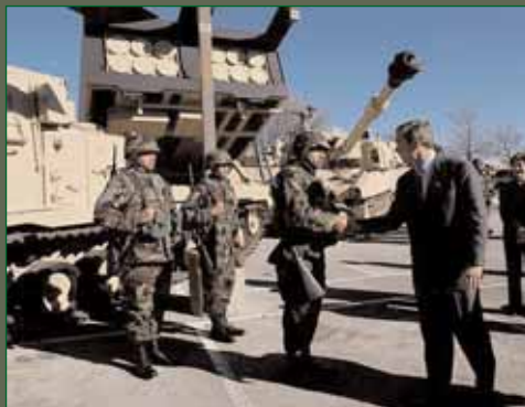
Fort Hood Army Base

Best-in-class for environmental performance and ergonomic and logistical advantages