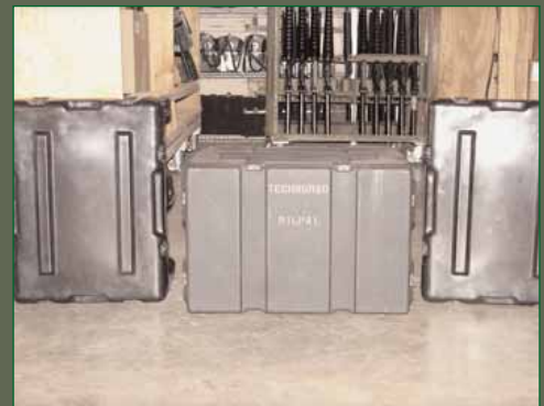
Technomad at Fort Hood Army Base