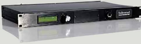
SuperConductor MP3 Player

Simple-to-use audio player-recorder, allows both instant playback and scheduled audio playback via an internal real-time clock. With flash-RAM (no hard-drive), the SuperConductor is tough and reliable. And unlike a PC-based solution, it can't catch virus or crash due to operating system errors.