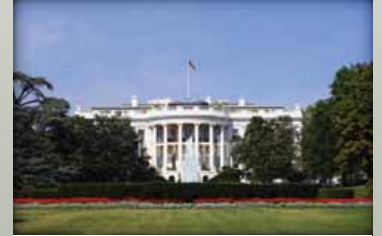
Canadian Armed Forces