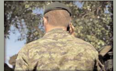
Canadian Armed Forces