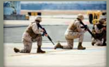
Canadian Armed Forces