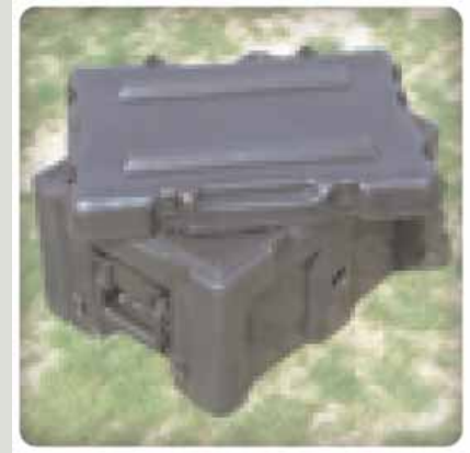
Rugged and tough, self-casing and palletizable and can be moved in compact elements